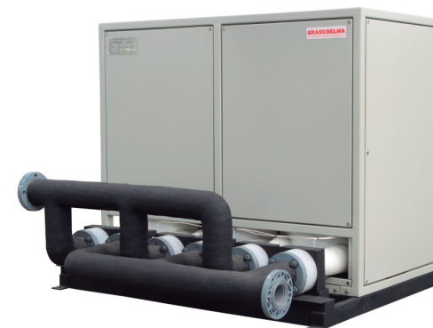
DIFHEMI – VILLARES 120 KW Sulphuric Acid Solution at 90 °C, 3 Bar – pipe of Teflon coated.

GEI-25HPW for high purity water GEI-25CS for chemical solutions GEI-25Sol for solvents GEI-25MP for milk pasteurization GEI-25JP for juice pasteurization