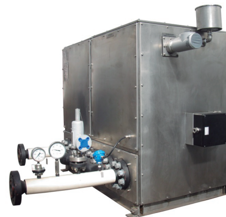
DIFHEMI - Petrobras 200KW natural gas, 100 bar, 90 ° C, Ex-oil platform in hazardous area

GEI-250xN/NG/H for oxygen, nitrogen, natural gas, hydrogen GEI-25SS for super steam GEI-25CA for compressed air GEI-25HFA/LPA for high flow rate air, low pressure air