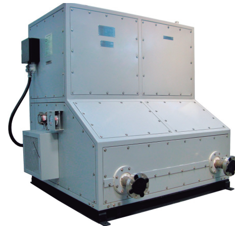
DIFHEMI - 180 KW – PETROBRAS, Steam superheating at 600 °C, 9 Bar

(*)The Dimensions above have been calculated taken into consideration pressure classes of 300/600 lbs, 20/40 Bar and temperature 200 ° C. There could be variation in the dimensions due to the change of these variables, for other pressures, flow rates and temperatures. If you needs an Induction Heater DIFHEMI for a thermal power between the interval of types specified above, or, as well if you should have DIFHEMI of more capacity higher than the maximum level above specified, please ask us. We will be able to build the DIFHEMI tailor-made for your needs without limit of power.