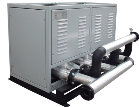
DIFHEMI - Biotins 45KW, 120 °C, for heating bovine tallow

GEI-25HO for heavy oil GEI-25T for tallow GEI-25VO for vegetable oil